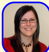
Easy Read & Web Site